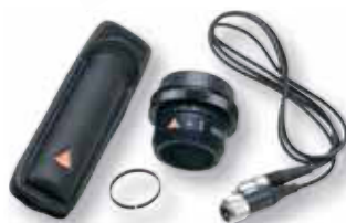
Photo Accessory Set

includes SLR Photo adaptor, adaptor cord, distance ring and BETA Belt Clip