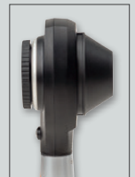
With contact plate