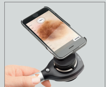
With mounting case for iPhone