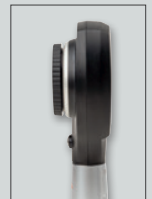
Without contact plate