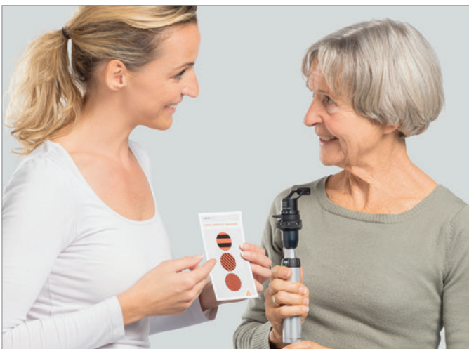
Figure 2: Line patterns of various thicknesses and angles.