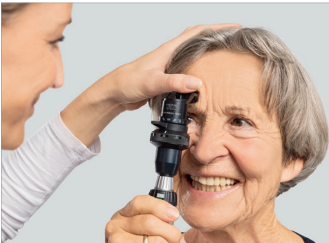
Figure 1: Patient exam using the HEINE LAMBDA 100 Retinometer.