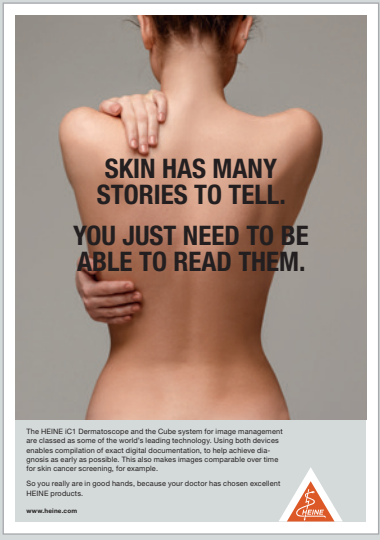
Poster for your waiting area

If you need material for your website, publications or events, please use the package with copyright-free photos and text, which we will be happy to make available to you. If you'd like more information, please don't hesitate to send an email to cube@heine.com.