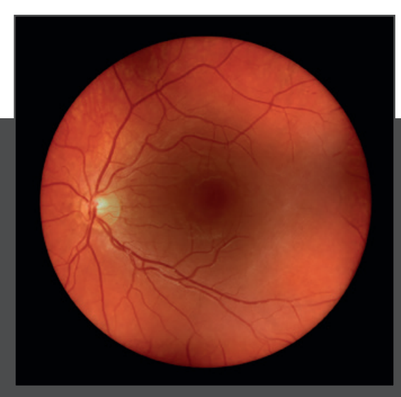
View of a retina through a cataract with visionBOOST*