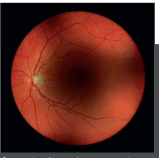
Common view of a retina through a cataract*